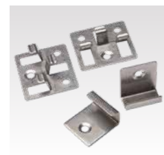
Stainless Steel Fixing Clips and Starter Clips

In addition to Composite Decking boards, the following components complete the system.