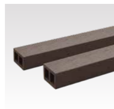
Composite Keel System