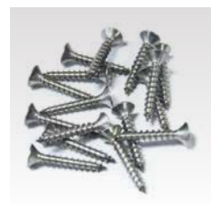
Stainless Steel Decking Screws