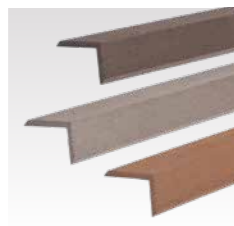
Colour-coded Edging Trims