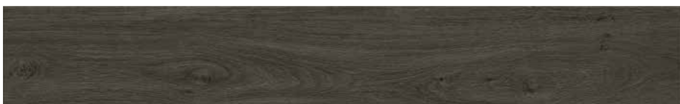
Amarillo Walnut 180 mm x 1,220 mm

Bring natural warmth into your space with our timeless wood finishes. Its life-like textures and rich tones create a welcoming ambiance, perfect for adding character to your interiors.