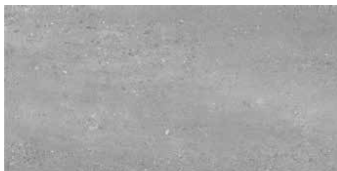
Genoa Stone 305 mm x 610 mm (XL - 457 mm x 914 mm)