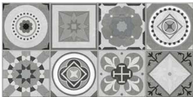
Valetta Mosaic 305 mm x 610 mm