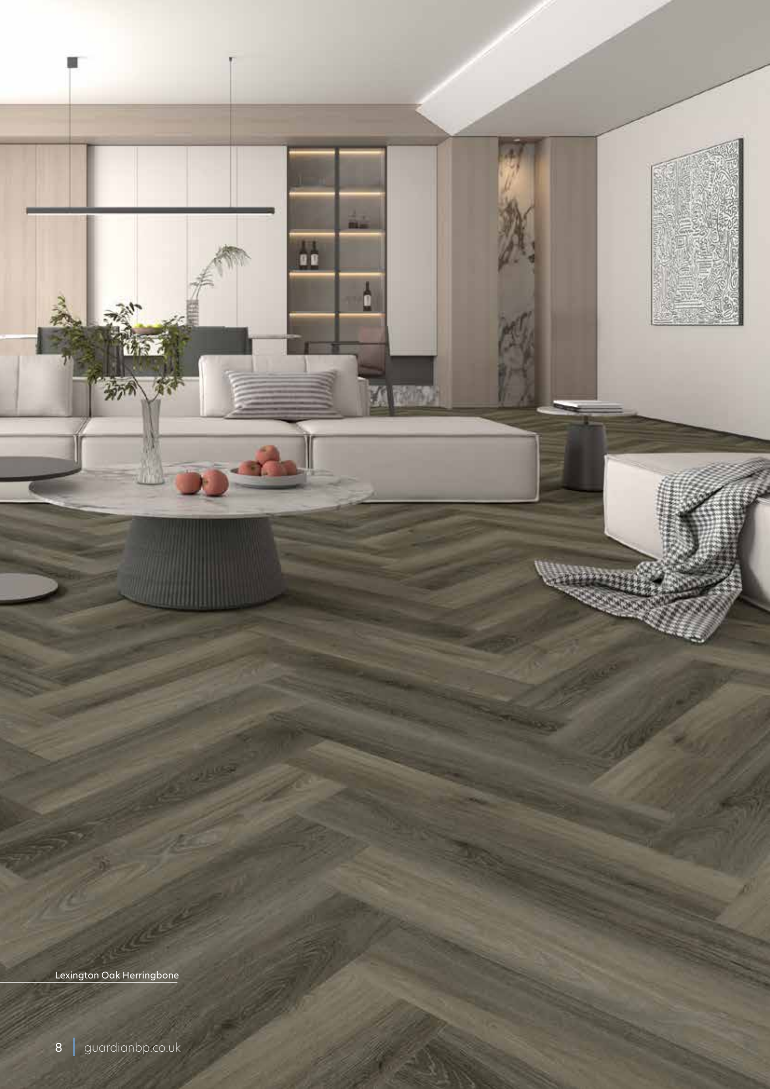
Lexington Oak Herringbone