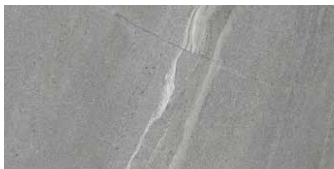
Montpellier Tile 305 mm x 610 mm