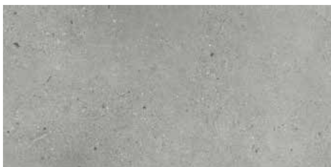
Tangier Stone 305 mm x 610 mm