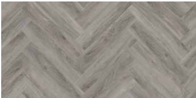
Concord Ash Herringbone 125 mm x 625 mm