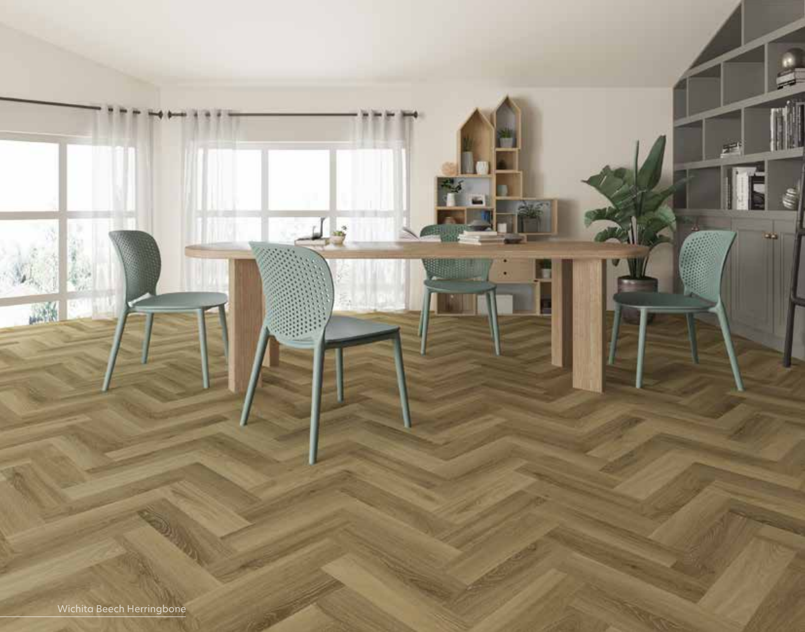
Wichita Beech Herringbone