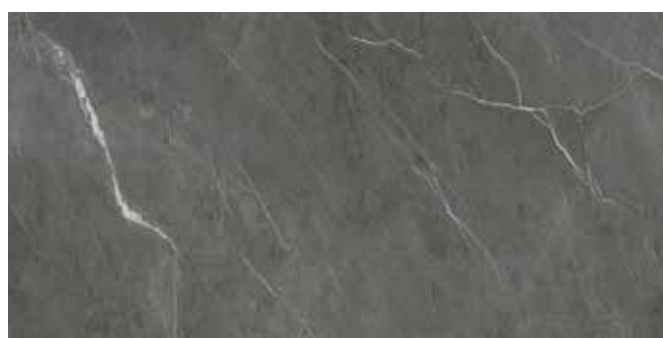
Palma Stone 305 mm x 610 mm (XL - 457 mm x 914 mm)