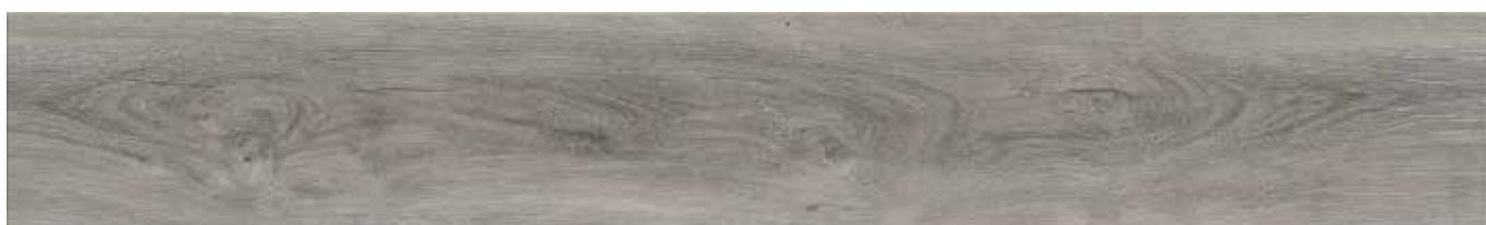
Concord Light Oak 180 mm x 1,220 mm