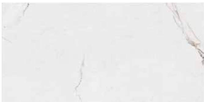
Cannes Tile 305 mm x 610 mm