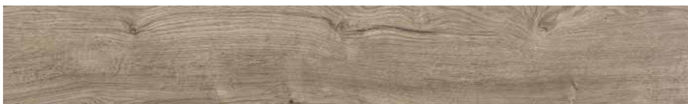
Boston Ash 180 mm x 1,220 mm