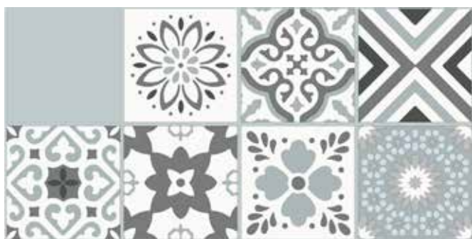
Corfu Mosaic 305 mm x 610 mm

Vibrant and bold our Mosaic Tiles bring energy and life into any space.