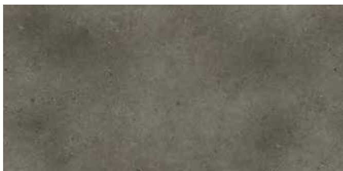
Florence Stone 305 mm x 610 mm