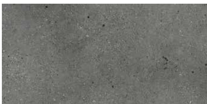
Lisbon Stone 305 mm x 610 mm

Add industrial beauty to your home with our stone flooring range. The earthy textures and natural tones bring a grounded, architectural feel to any space.