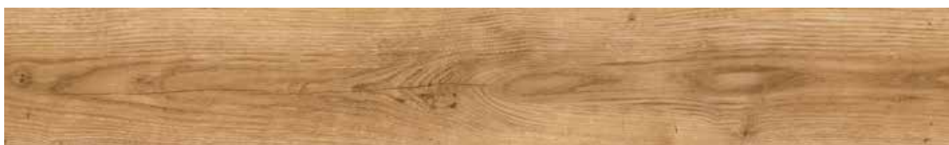
Denver Oak 180 mm x 1,220 mm