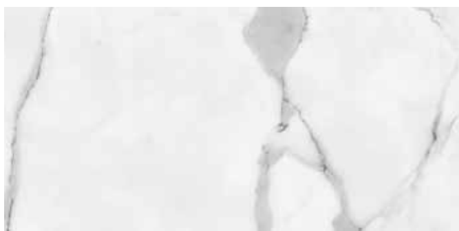
Porto Tile 305 mm x 610 mm